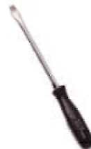
Medium size screwdriver