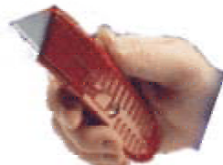
Sharp razor knife