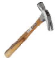
Medium size hammer