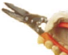
Wiss Metal Master Snips

If you use a razor type knife, place on the indentation, tap lightly with a small hammer until the lip of the lid is cut at this point. Continue the same on all indentation on the lid, then pry open with a screwdriver.